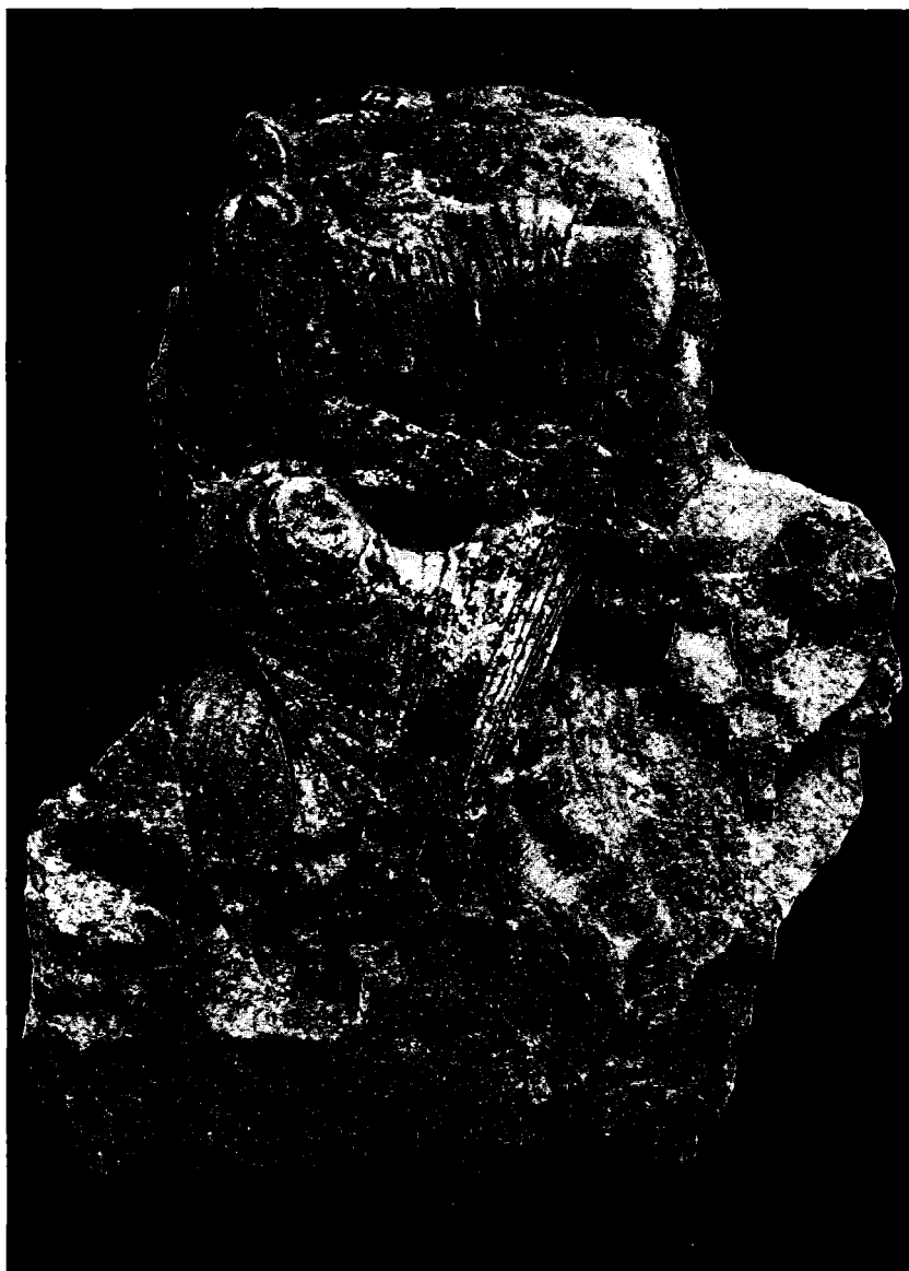
Fig. 3 – Relief fragment with seated male figure. From Saidu Sharif I. Museo Nazionale d'Arte Orientale "Giuseppe Tucci", Rome (Inv. S 1246; after D. Faccenna, Il fregio figurato dello Stūpa Principale nell'area sacra buddhista di Saidu Sharif I, Roma, 2001, Pl. 58c).