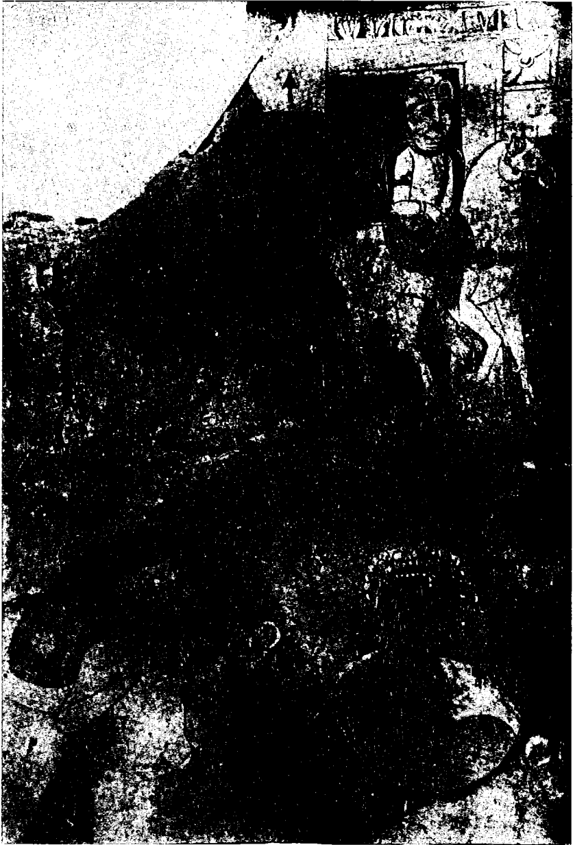
Fig. 6 – Detail of the previous piece (A. Stein, Serindia, op. cit., fig. 134).