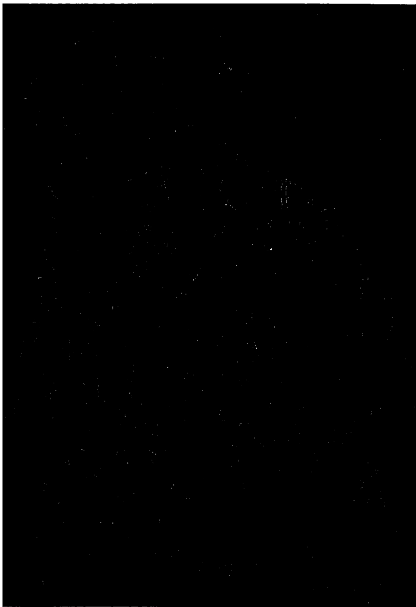
Fig. 2 – Unidentified scene. From Miran, temple M III. National Museum, New Delhi (after M. Bussagli, Painting..., op. cit., fig. on p. 22).