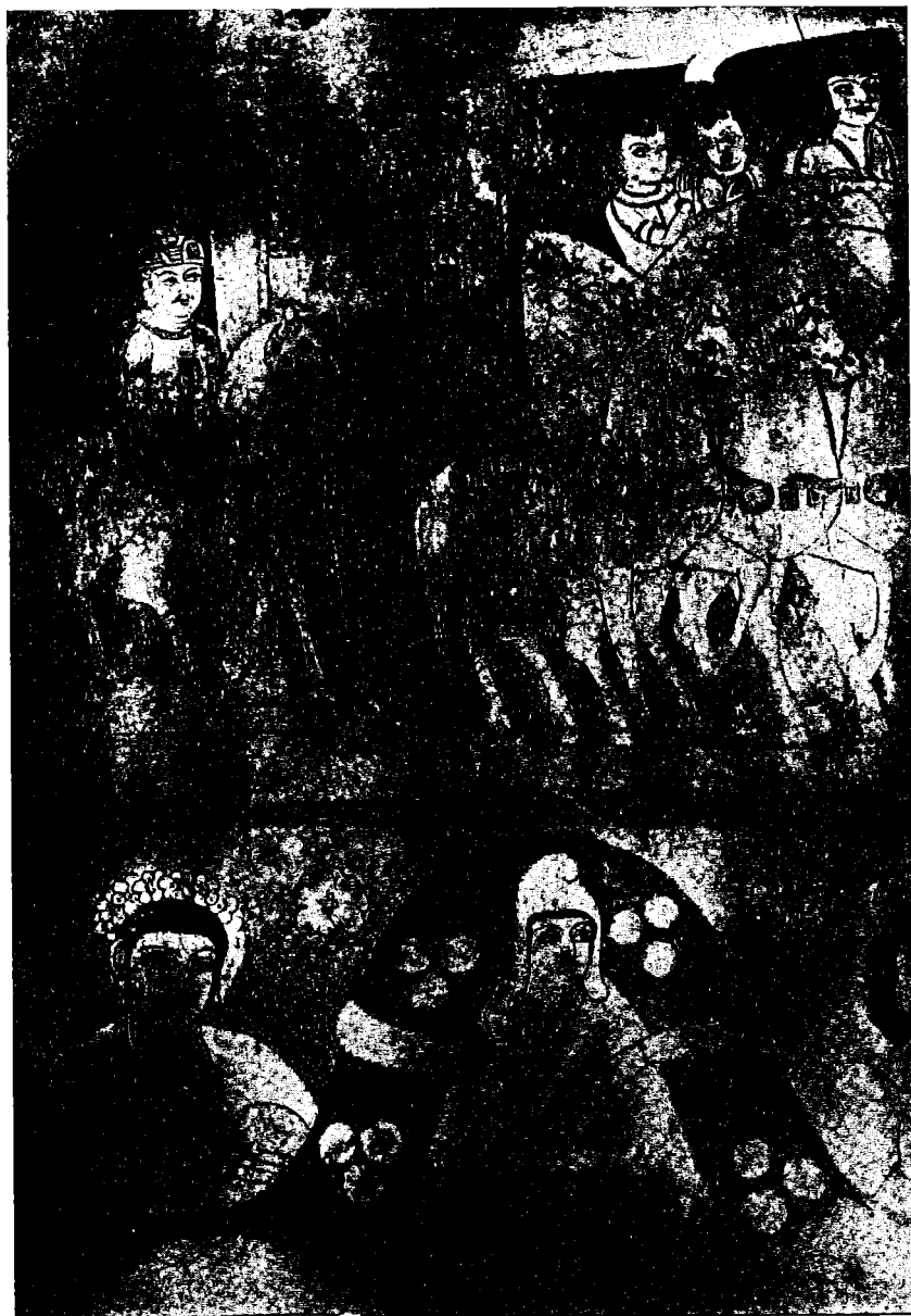
Fig. 5 – Painting fragment with scene from the Vessantara-jātaka. From Miran, temple M V. (after A. Stein, Serindia, Oxford, 1921, fig. 135).