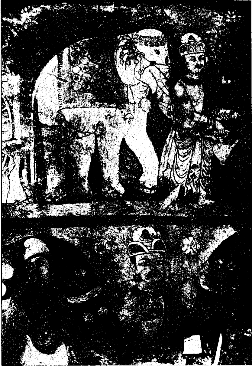
Fig. 9 – Painting fragment with scene from the Vessantara-jātaka. From Miran, temple M V. (after A. Stein, Serindia, op. cit., fig. 137).